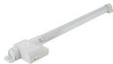
LED 122 Movement Sensor and magnet mount 122040-30