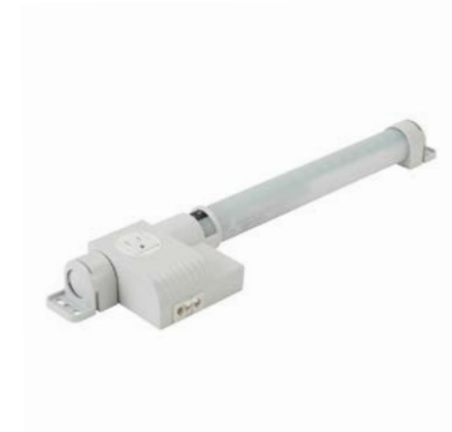
LED 121 On/Off Switch and screw mount 121040-00