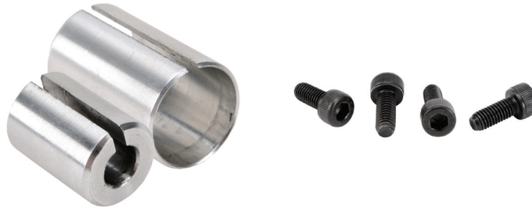
Typical PGCN Accessory Bushings Typical PGCN Accessory Screws