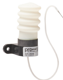
Part No. LTACC-3