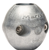
Part No. LTACC-4