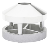
Part No. LTACC-1