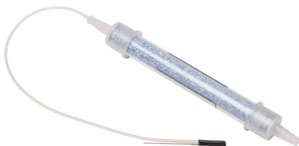
Part No. LTACC-2