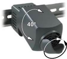
Range of Rotation