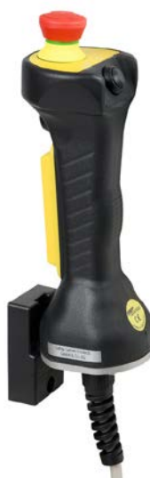
ZEUS11-131430 resting in the ZEUS-H glass-fiber reinforced mounting bracket