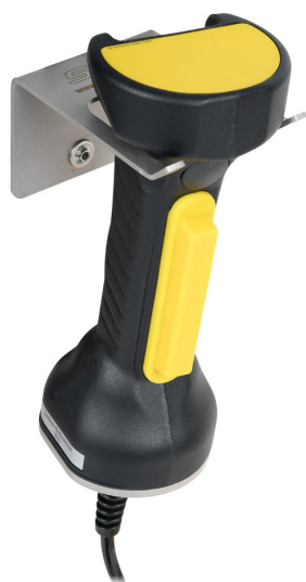
ZEUS01-000000 resting in the ZEUS-H2 stainless steel mounting bracket