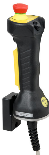
ZEUS11-131430 resting in the ZEUS-H glass-fiber reinforced mounting bracket