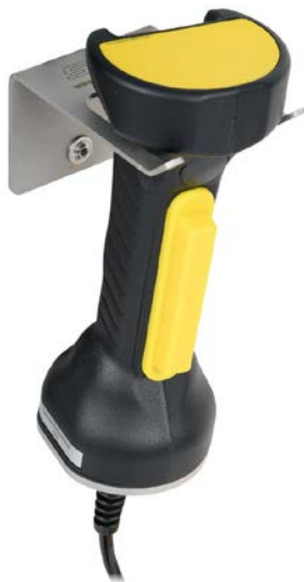
ZEUS01-000000 resting in the ZEUS-H2 stainless steel mounting bracket