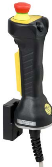
ZEUS11-131430 resting in the ZEUS-H glass-fiber reinforced mounting bracket