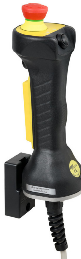
ZEUS11-131430 resting in the ZEUS-H glass-fiber reinforced mounting bracket