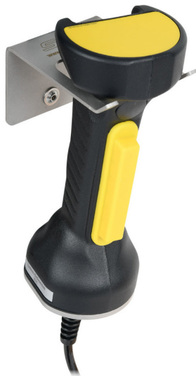
ZEUS01-000000 resting in the ZEUS-H2 stainless steel mounting bracket