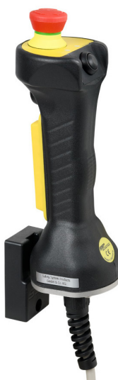
ZEUS11-131430 resting in the ZEUS-H glass-fiber reinforced mounting bracket