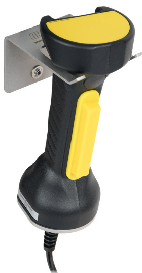
ZEUS01-000000 resting in the ZEUS-H2 stainless steel mounting bracket