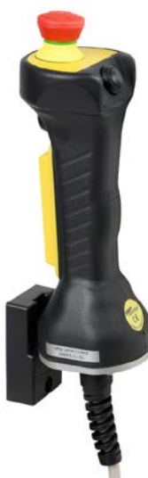
ZEUS11-131430 resting in the ZEUS-H glass-fiber reinforced mounting bracket