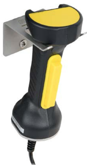
ZEUS01-000000 resting in the ZEUS-H2 stainless steel mounting bracket