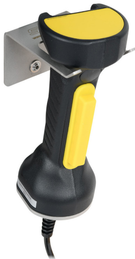
ZEUS01-000000 resting in the ZEUS-H2 stainless steel mounting bracket