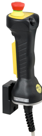
ZEUS11-131430 resting in the ZEUS-H glass-fiber reinforced mounting bracket