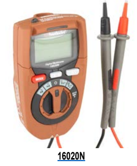
* NCV - Non-Contact Voltage