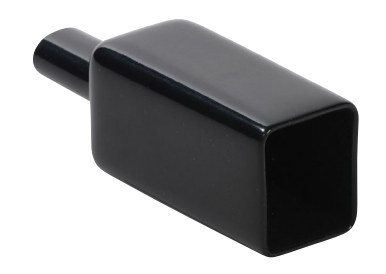
RIR Module Protective Sleeve SLV48