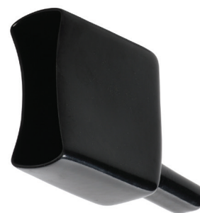
RIP/RIQ Module Protective Sleeve SLV47