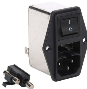
RIP Module with fuse tray removed