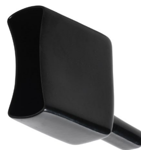
RIP/RIQ Module Protective Sleeve SLV47