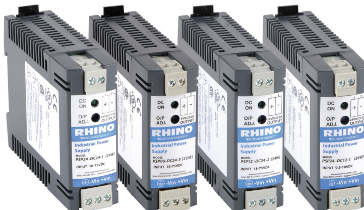
PSP 25 Watt DC-DC Converters