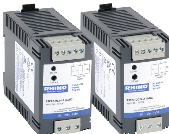
PSP 60 Watt DC-DC Converters