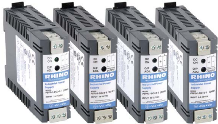
PSP 25 Watt DC-DC Converters