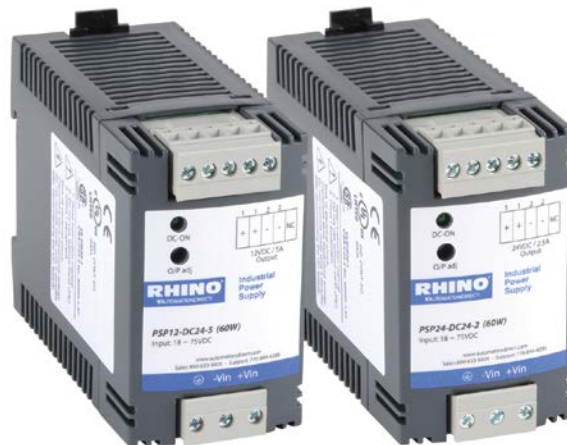
PSP 60 Watt DC-DC Converters