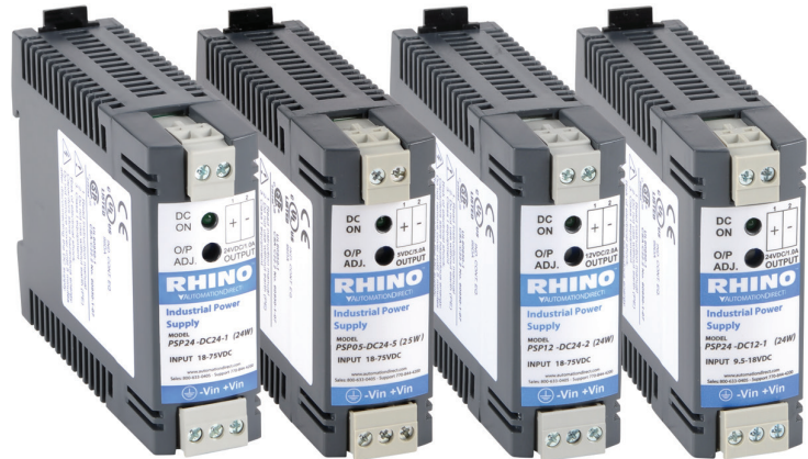
PSP 25 Watt DC-DC Converters

Both 25W and 60W DC-DC converters are available in the Rhino PSP DIN rail series. Wide input ranges of 9.5 to 18VDC and 18 to 75VDC allow these models to operate from all popular DC supply voltage systems. With tightly regulated output voltage these DC-DC converters provide a reliable power source for sensitive loads in industrial process controls, factory automation and other equipment exposed to a critical industrial environment. They can be used to isolate a specific load from the 24 volt bus voltage, and offer easy installation with snap-on DIN rail mounting and detachable screw terminal blocks.