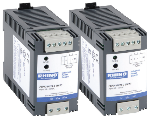
PSP 60 Watt DC-DC Converters