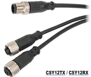
CSY12TX / CSY12RX

When four M5 muting sensors are installed with a ReeR Safegate light curtain, CSY12TX and CSY12RX Y-splitters will be required.