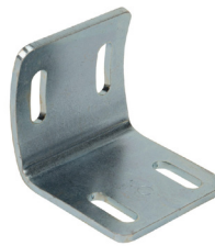
SFB-4SG / SFB-6SG