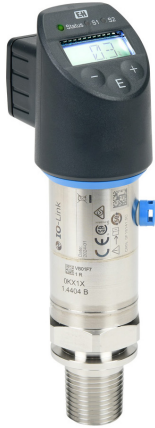
Part No. PTP31B-CA7M1FGFVXJ