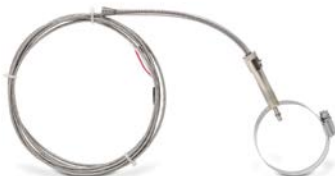
Shown with optional PCA pipe clamp adapter