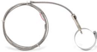
Shown with optional PCA pipe clamp adapter