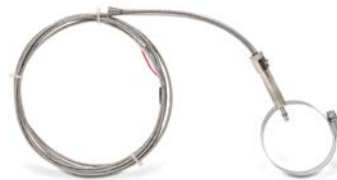
Shown with optional adjustable immersion sensor