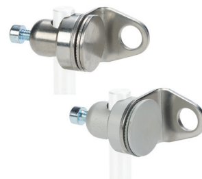
OPT2114 , OPT2115

Note: 304 stainless steel mounting rods sold separately: OPT2109 (200mm [7.87 in] length), OPT2110 (300mm [11.81 in] length), and OPT2111 (500mm [19.69 in] length).