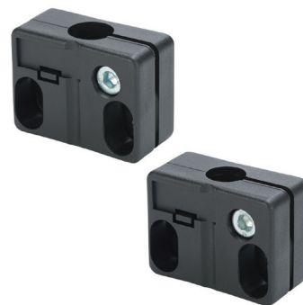
OPT2102 , OPT2103