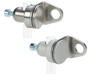
OPT2114 , OPT2115

Mounting bracket, right-angle swivel, 360 degree vertical and horizontal adjustment, 12mm rod mount. For use with 12mm sensors. Available in all stainless steel or with an aluminum head and stainless steel mounting plate.