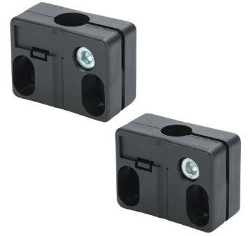
OPT2102 , OPT2103

Mounting bracket, right-angle, fixed insertion stop adjustment, plastic. For use with 12mm sensors. Available with or without fixed insertion stop.