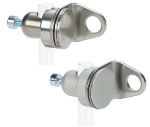
OPT2114 , OPT2115

Note: 304 stainless steel mounting rods sold separately: OPT2109 (200mm [7.87 in] length), OPT2110 (300mm [11.81 in] length), and OPT2111 (500mm [19.69 in] length).