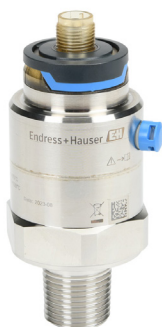
Part No. PMC21-CA1M1CFVXJA

Click on the thumbnail or go to https://www.automationdirect.com/VID-PS-0030 for a short video on Endress+Hauser Cerabar Pressure Transmitters