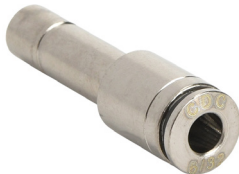
Part No. PR14-532-B

NITRA pneumatic push-to-connect plug-in reducer fittings with nickel plated brass body and stainless steel tube gripping claws. For use with flexible tubing. Five fittings per package.