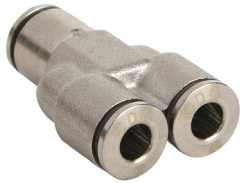
Part No. UY532-B

NITRA pneumatic push-to-connect union Y fittings with nickel plated-brass body and stainless steel tube gripping claws. For use with flexible tubing. Five fittings per package.