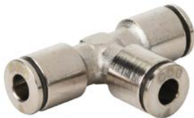
Part No. UT532-B

NITRA pneumatic push-to-connect union T fittings with nickel plated brass body and stainless steel tube gripping claws. For use with flexible tubing. Five fittings per package.