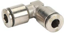
Part No. UL532-B

NITRA pneumatic push-to-connect union elbow fittings with nickel-plated brass body and stainless steel tube gripping claws. For use with flexible tubing. Five fittings per package.