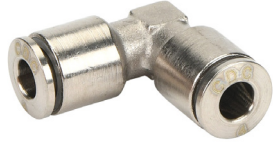
Part No. UL532-B

NITRA pneumatic push-to-connect union elbow fittings with nickel-plated brass body and stainless steel tube gripping claws. For use with flexible tubing. Five fittings per package.