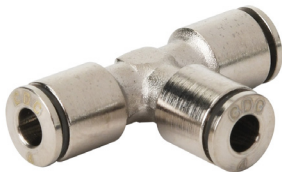
Part No. UT532-B

NITRA pneumatic push-to-connect union T fittings with nickel plated brass body and stainless steel tube gripping claws. For use with flexible tubing. Five fittings per package.