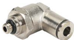
Part No. ME532-10N-B

NITRA pneumatic push-to-connect male elbow fittings with rotating nickel-plated brass body, nickel-plated brass threads, stainless steel tube gripping claws and pre-applied Teflon thread sealant (#10-32, M5 and G threads have O-ring instead of thread sealant). For use with flexible tubing. Five fittings per package.