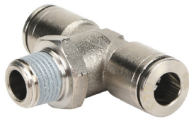
Part No. MBT14-18N-B

NITRA pneumatic push-to-connect male branch tee fittings with rotating nickel-plated brass body, nickel-plated brass threads, stainless steel tube gripping claws and pre-applied Teflon thread sealant (#10-32, M5 and G threads have O-ring instead of thread sealant). For use with flexible tubing. Five fittings per package.