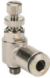
Part No. FVS532-10N-B

NITRA pneumatic push-to-connect male elbow flow control valves with rotating nickel-plated brass body, nickel-plated brass threads, stainless steel tube gripping claws and pre-applied Teflon thread sealant (#10-32, M5 and G threads have O-ring instead of thread sealant). All valves are free flow in, controlled flow out. For use with flexible tubing. Two fittings per package.