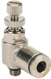
Part No. FVS532-10N-B

NITRA pneumatic push-to-connect male elbow flow control valves with rotating nickel-plated brass body, nickel-plated brass threads, stainless steel tube gripping claws and pre-applied Teflon thread sealant (#10-32, M5 and G threads have O-ring instead of thread sealant). All valves are free flow in, controlled flow out. For use with flexible tubing. Two fittings per package.