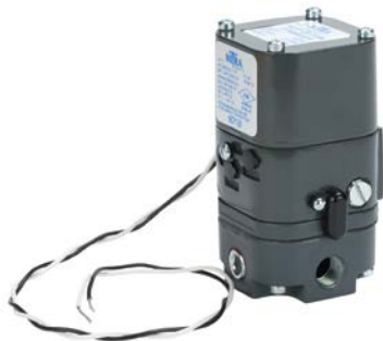
Part No. NCP1-20-315N