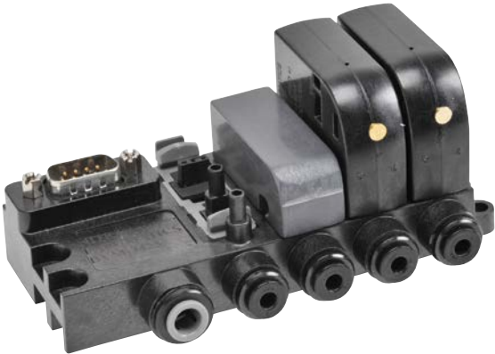
Above photo shows an assembled BVM Series manifold with BVS Series Solenoids and BVM blanking plug Note: Manifold must have a BVS valve (flying leads ONLY)