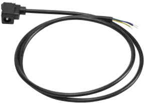
See solenoid valve cables and connectors section