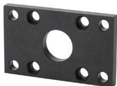
Part no. D2FM-2