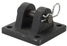
Part no. D2PC-3