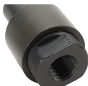
Part no. D2RCP-2

NITRA self-aligning rod couplers reduce cylinder alignment issues by compensating for \pm 1^\circ angular error and 1/16" lateral misalignment on both the extension and retraction strokes. Better reliability by reducing cylinder and component wear.