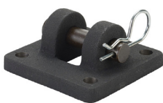
Part no. D2SPC-3