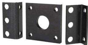
Part no. D2AM-3