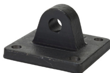
Part no. D2PA-3