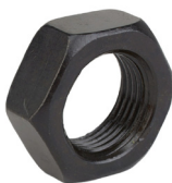
Part no. D2-34-16