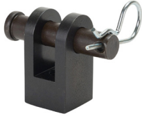
Part no. D2RC-2