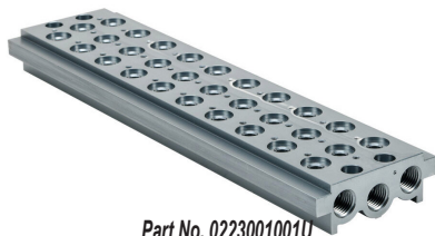
Part No. 0223001001U

Metal Work Series 70 valve manifolds are an excellent choice for installing several Series 70 air pilot or solenoid valves in a pneumatic system.