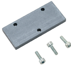
Part No. 0226004500