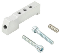
Part No. 0226004600