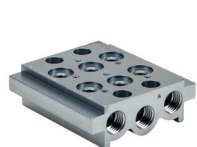
Part No. 0223000201U