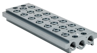
Part No. 0223000701U