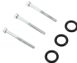
Part No. 0226004701