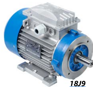
18J9 C-face/ removable rigid base (B34)