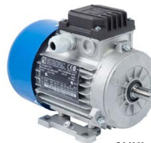
ONUL Rigid Base (B3)