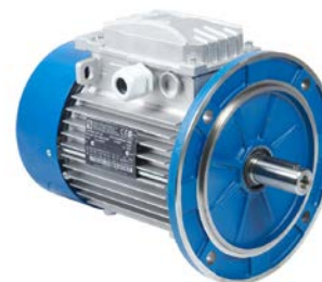
18OR D-flange (B5)