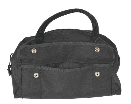
Side Pocket w/Snapping Flap