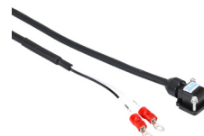
APCS-BN series brake cable