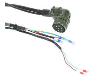
APCS-PxxPB series power cable