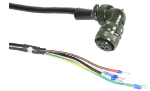
APCS-PxxHS series power cable