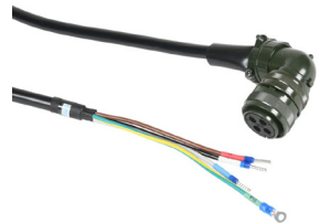
APCS-PxxIS series power cable