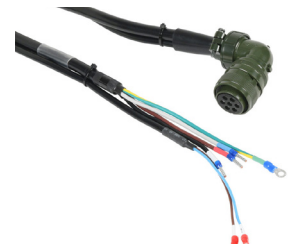
APCS-PxxNB series power cable