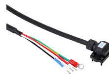
APCS-PN series motor cable