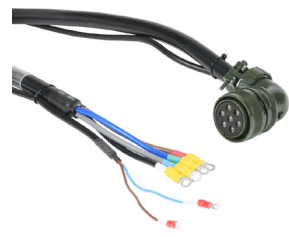
APCS-PxxLB series power cable