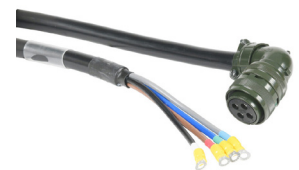
APCS-PxxJS series power cable