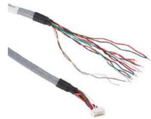
AMT-18C-3-036 AMT-18C-3-072 AMT-18C-3-120