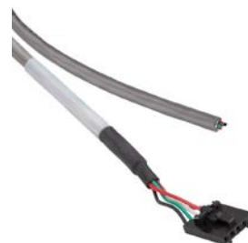
CUI-3131-6FT CUI-3131-10FT CUI-3131-20FT