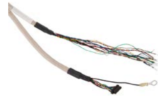
AMT-17C-1-036 AMT-17C-1-072 AMT-17C-1-120