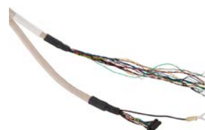
AMT-17C-1-036 AMT-17C-1-072 AMT-17C-1-120