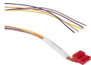
CUI-435-1FT CUI-435-10FT CUI-435-20FT