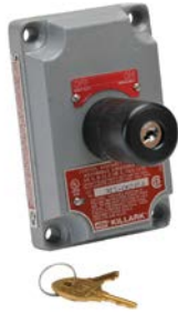
Key-Operated Selector Switch