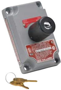
Key-Operated Selector Switch