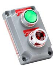
Pilot Light / Pushbutton