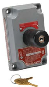
Key-Operated Selector Switch