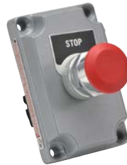
Push-Pull Mushroom Maintained Pushbutton