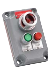
Pilot Light / Two Mini Pushbutton