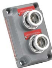
Double Pilot Light