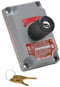
Key-Operated Selector Switch