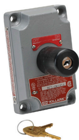
Key-Operated Selector Switch