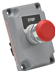
Push-Pull Mushroom Maintained Pushbutton