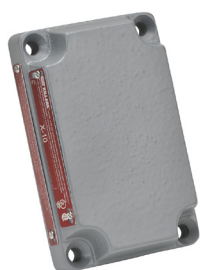
X-10 Blank Cover