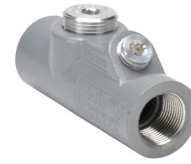
ENY-2 Sealing Fitting

The purpose of seals in a Class I hazardous location is to minimize the passage of gases and vapors and prevent the passage of flames from one electrical installation to another through the conduit system. Consult the electrical code or your local inspector for more detailed information.