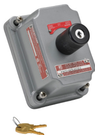
Key-Operated Selector Switch