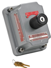
Key-Operated Selector Switch