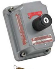
Key-Operated Selector Switch