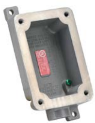
FXB-2 Dead End